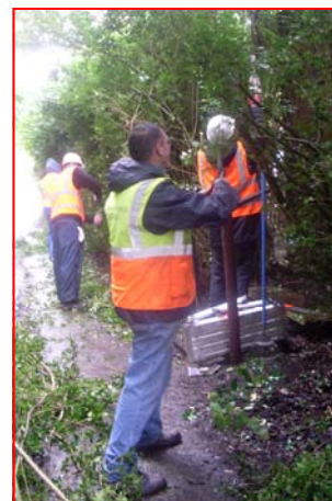
Tintwhistle Safety Partnership work