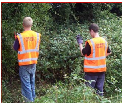
Mickleover Meadows - improving public areas