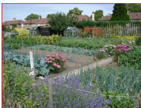
Award winning allotment at Rowditch