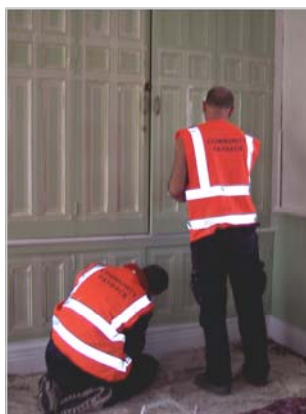
Community rooms re-decoration