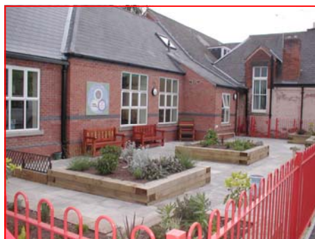
Allenton library - public space from unused plot