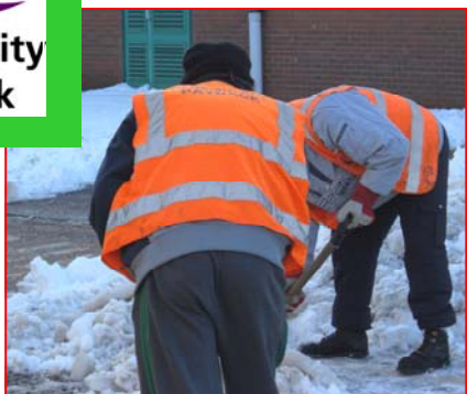
Chesterfield Royal Hospital - snow clearance