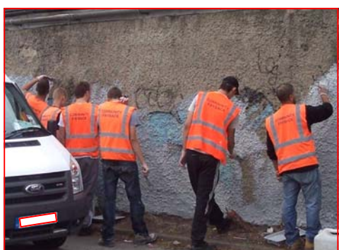
Long Eaton - graffiti removal