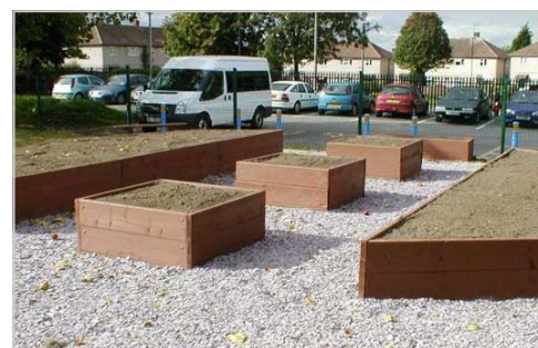
Raised beds Brackensdale School