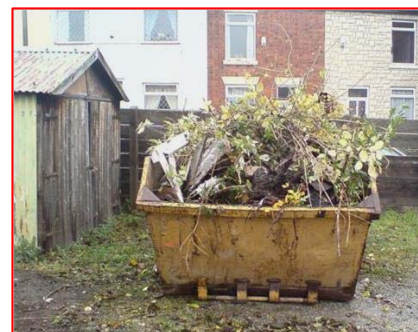
Rubbish clearance - cleaner, safer feeling public areas

See our website for more Community Payback information and examples